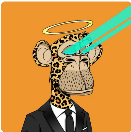
YUGA LABS (EST. 2021) BORED APE YACHT CLUB #8746